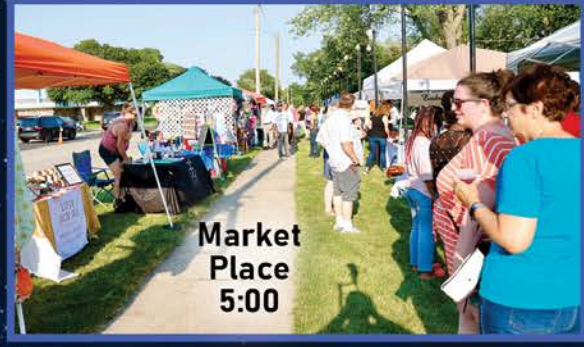
Market Place 5:00