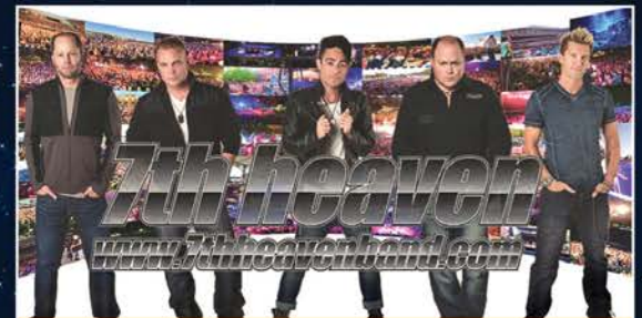
7th heaven 7:30 August 6th

7th heaven is a Hillside favorite who are known throughout the Midwest as the band who has audiences cheering as they play 30 rock classics in 30 minutes.