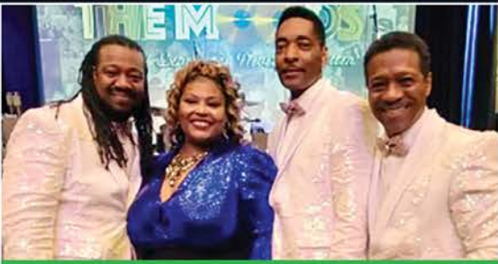
The Moods 7:30 August 13th

Come along with The Moods on a musical journey back to the 60s and 70s, the heyday of Mbtown, R & B, funk, soul, and disco.