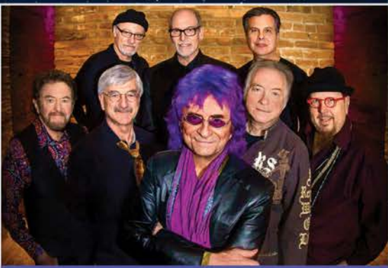
Ides of March 7:30 August 20th

Their variety of music along with their excellent song execution are the strengths behind their sound that gets the audience involved.