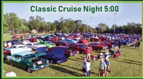
Classic Cruise Night 5:00

One Of The Boyzz are weaned on the hard-driving industrial-strength rock 'n' roll of Chicago's music scene. They have shared the stage with Aerosmith, The J. Geils Band, Meatloaf, Cheap Trick, REO Speedwagon, ZZ Top, The Doobie Brothers, and Rare Earth.