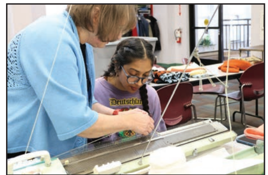
Two of the Club Members diligently knitting a cap