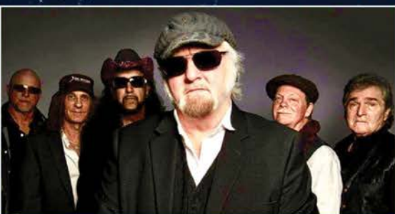
One Of The Boyzz 5:30 August 20th

Come listen to The Ides Of March on their Diamond Anniversary Tour Celebrating 60 Years with all the original members as they play their numerous Billboard 100 hits. Led by songwriter Jim Peterik, who wrote Eye of the Tiger for the Rocky III movie, the Ides will have you on your feet singing and dancing.