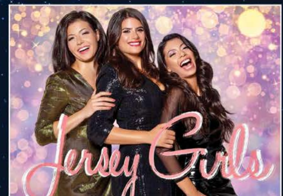
Jersey Girls 5:30 August 6th

A tribute to all iconic DIVAS, Jersey Girls belt out your favorite "Oldies-but-Goldies"... a must see for anyone who loves to dance and who appreciates good music!