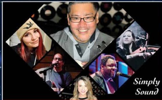
Simply Sound 5:30 July 23rd

American English is the best Beatle tribute story of our time. They headlined International Beatle Week in Liverpool in front of a crowd of 50,000 and incited American English Beatlemania during their tour of Japan!