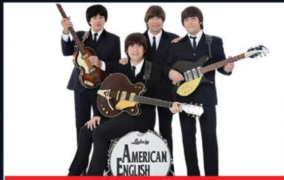
American English 7:30 July 23rd

American English is the best Beatle tribute story of our time. They headlined International Beatle Week in Liverpool in front of a crowd of 50,000 and incited American English Beatlemania during their tour of Japan!