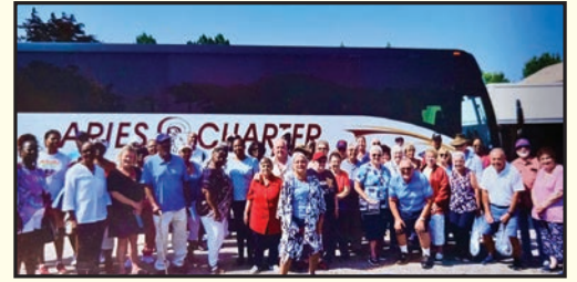
Fun Field Trips