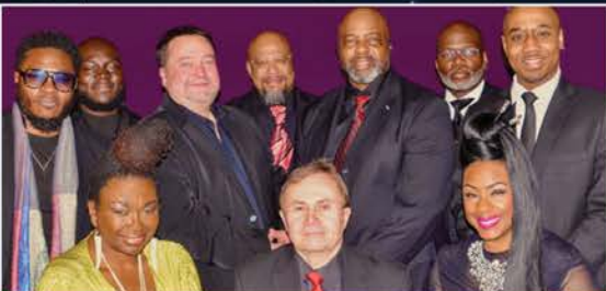
Soul 2 The Bone 5:30 August 13th

Come along with The Moods on a musical journey back to the 60s and 70s, the heyday of Mbtown, R & B, funk, soul, and disco.