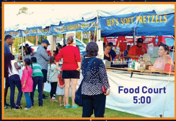
Food Court 5:00