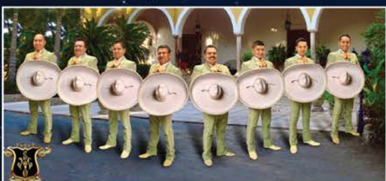
Mariachi Show Sol De Oro 5:30 July 30th