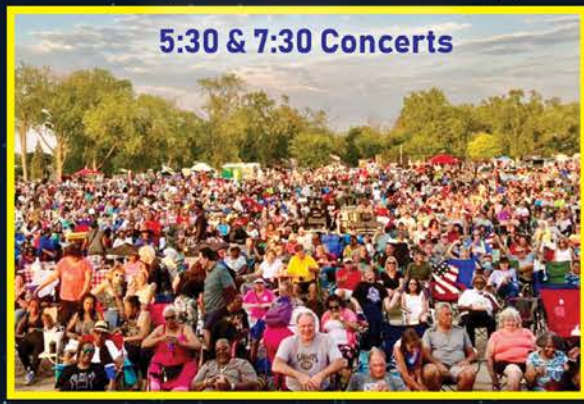
5:30 & 7:30 Concerts

At The Hillside Commons 4950 Washington St. In Hillside