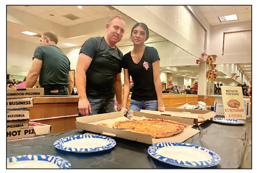
Q's Pizza employees stand near their popular cheese pizza during the Westchester Chamber of Commerce's inaugural Pizza Palooza on Oct. 27 at the Westchester Recreation Center.

The Original Chickies Beef & Banquet, 4152 Roosevelt Rd. in Hillside, earned the top prize in the "Best Crust" category while Paul's Pizza & Hotdogs, 3044 S. Wolf Rd. in Westchester, earned bragging rights for "Best Sauce."