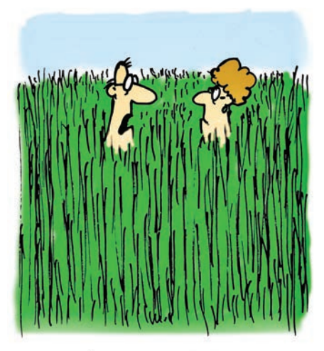
"I CAN'T CUT THE GRASS UNTIL I FIND THE LAWNMOWER AND I CAN'T FIND THE LAWNMOWER UNTIL I CUT THE GRASS!"