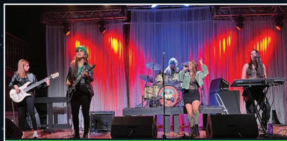
Serendipity 5:30 August 8th

Serendipity is one the area's top pop/rock band who play a combination of popular 60's, 70's and 80's covers as well as current pop hits.