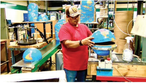
More than 10 employees are involved in the production of one globe copy

The facility includes a massive warehouse 200 feet deep and 38 feet high where completed globes and raw materials are stored. Meantime in a facility about five minutes away in Broadview, the company’s wood shop is buzzing.