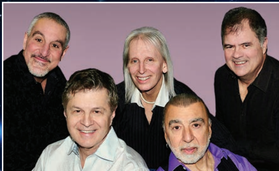
The Buckingham's 7:30 July 18th