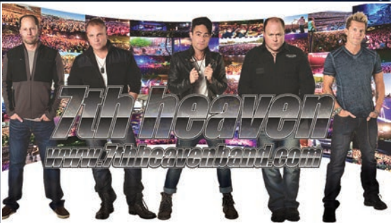
7th heaven 7:30 August 8th

Serendipity is one the area's top pop/rock band who play a combination of popular 60's, 70's and 80's covers as well as current pop hits.