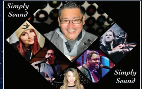
Simply Sound 5:30 August 22nd

Started as a duo in 2013, SIMPLY SOUND has grown into a family of talented artists covering the popular songs from the 80's through today.