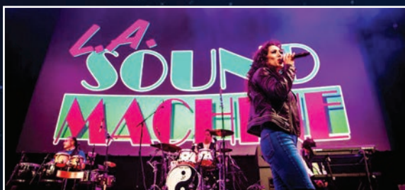
L.A. Sound Machine 7:30 July 25th

Mariachi Show Sol De Oro is one of the area's premier mariachi bands whose music will have you feeling like you are in old Mexico sipping on a cerveza.