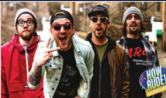
How Rude! 5:30 August 15th

7th heaven is a Hillside favorite who are known throughout the Midwest as the band who has audiences cheering as they play 30 rock classics in 30 minutes.