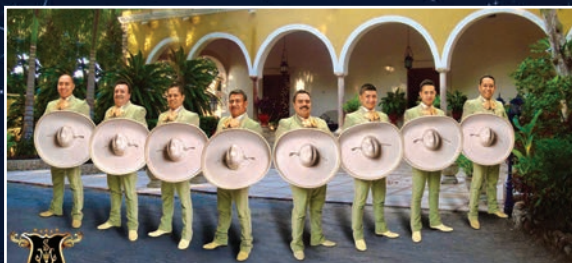
Mariachi Show Sol De Oro 5:30 July 25th

The Buckingham's are one of Chicago's most famous bands who had several Billboard top 10 hits, including their #1 hit, Kind of a Drag... always a great concert!