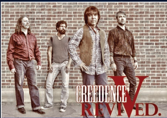
Credence Revived 7:30 August 15th

How Rude! Brings you all of the best hits from the 90's... from grunge to pop, they cover it all! So, throw on your rad overalls and come party with How Rude!