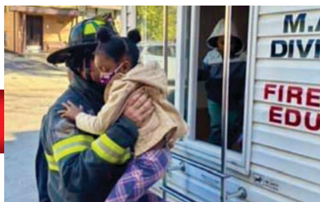
Fire Department Hosts Multiple Fire Safety Education Talks for Children