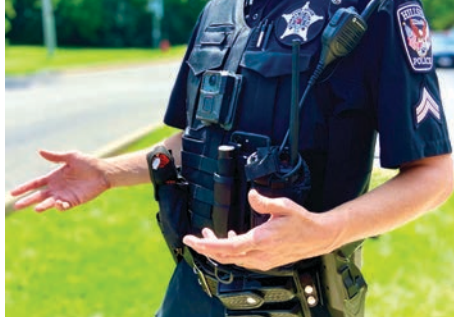
Hillside Police Officer Wearing Body-Worn Camera

While on cameras, the Department has “Flock Camera Readers” installed in high traffic areas. The Flock readers give officers the ability to search for vehicles based on full and partial license plate numbers, make and model, and to flag vehicles for investigative purposes. The cameras provide police officers with real-time notification on their laptops or cell phones when vehicles are tagged as stolen or wanted as they enter or exit Hillside. Their use is intended to solve crimes.