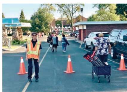
EMA Handles Crowd Control at Hillside Events

In December, they installed decorative planters for the holiday in the Butterfield business district and at the corner of Taft and Electric. These planters will have blooming plants in them come this Spring. In October, Public Works purchased a much-needed Vactor Truck that is used for cleaning catch basins, culverts, storm drains, and handling large-scale clean-up operations like sewer or septic systems.