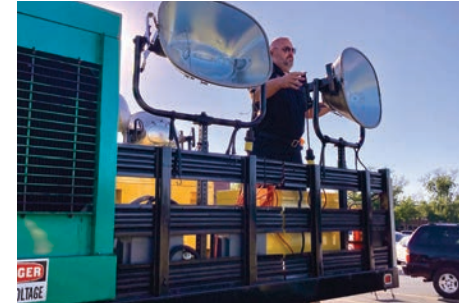
EMA Volunteer Readyng Lights for Summer Concert

They are currently seeking volunteers. If you want to make a difference for our community sign up to be an EMA volunteer by picking up a membership application at the Hillside Village Hall. Fill out this short form and someone from EMA will call you. They meet the first and third Wednesday of every month from 7:00 to 9:00 P.M. Meetings are held at our Emergency Operations Center located at 4151 May Street in Hillside.