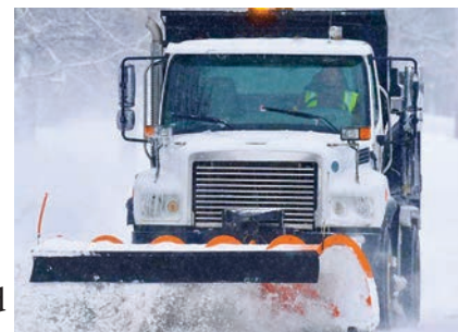
Public Works Known for Being the Best in the Area for Keeping Streets Clear of Snow

have experienced (347 hours) in many years to keep up with the relentless weather conditions