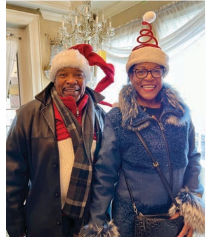
Having Yuletide Fun at Hillside Senior Club Holiday Party

In May, we hosted our 20th Martin Luther King Jr. Breakfast that was sold out as usual. The Village sponsored numerous 2022 events for Hillside residents young and old alike. We had an Easter Egg Hunt , Movie in the Park , Game Truck Fun Day , Halloween Costume/Bonfire Night , a Visit with Santa , Tree Lighting Ceremony , Holiday Parade of Lights , a Family Bowling Extravaganza , Project UFO Village-Wide Cleanup Day , a Reptile Show , Back to School Luncheon , Annual Cemetery Tour , the Fly Fox Zoo , Toys for Tots Drive with Sheet Metal Workers' Local 73, and what is fast becoming a community favorite... Autumnfest on the Prairie Path. We also hosted a seminar on how to appeal your real estate property taxes.