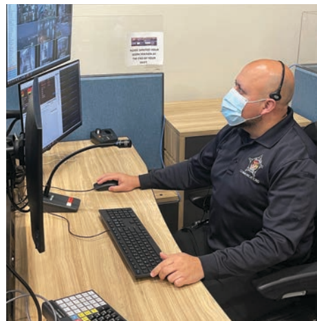
In 2022 the Dispatch Center Switched to a More Efficient Radio Network System

The Dispatch Center expanded and took over dispatching duties for the Berkeley Fire Department. This has allowed for quicker more efficient response times. The Village was awarded a $139,186.90 grant as a reimbursement for funds already spent on consolidation of the two departments into one Dispatch Center.