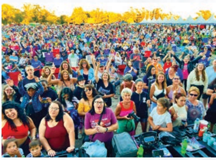
Thousands flock to Hillside Commons for Summer Nights in Hillside Concerts

I have always said very few villages host as many events for their residents as Hillside. In 2022 we were once again able to host many events that were canceled in the previous year due to Covid.