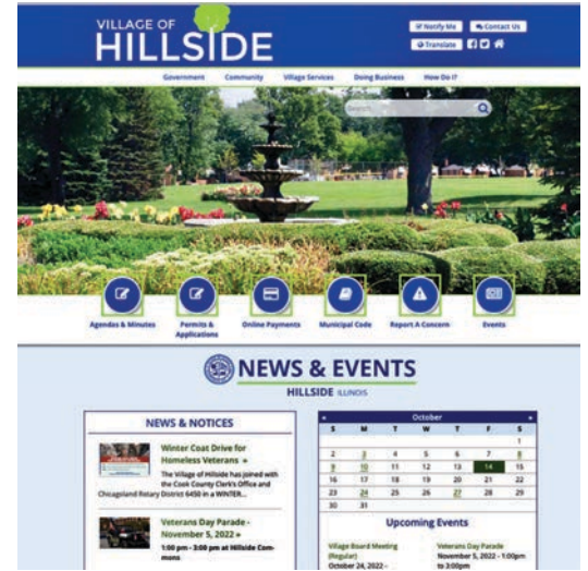
Redesigned Village Website That Is More User Friendly

After 6 months of department and Village employees' input, the Village's website was updated to better reflect today's need for pertinent and better information. The website is now more user friendly and has many Village forms you can fill out on on-line rather than coming to the Village Hall for these forms. Give it a look at: www.hillside-il.org .