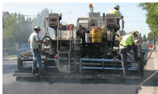
Public Works coordinated with Department of Transportation on Wolf Road Construction Project

Public Works performs many tasks such as cleaning garbage and debris around the Village, removing dead animals, filling potholes, maintaining signage, trimming trees, and removing Village trees as needed. They are also reporting and repairing streetlights, maintaining vehicles in addition to countless other requests and needs, such as repairing water main breaks.