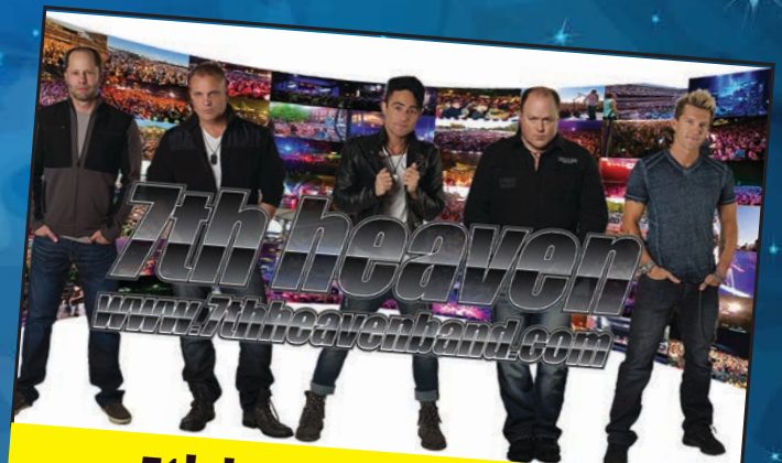
7th heaven August 9th

The Market Place, Cruise Nights, and Food & Beer Vendors Begin at 5:00 P.M. Concerts Begin at 7:30 P.M.