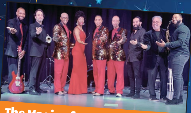
The Magic of Motown July 19th