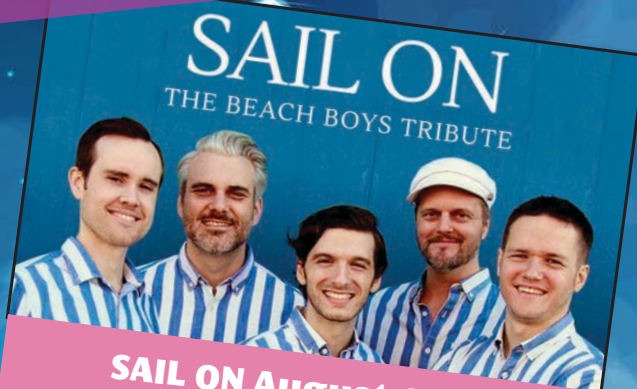
SAIL ON August 16th