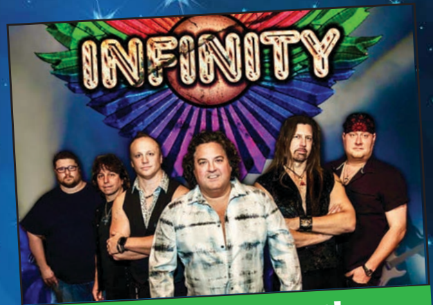
INFINITY July 26th